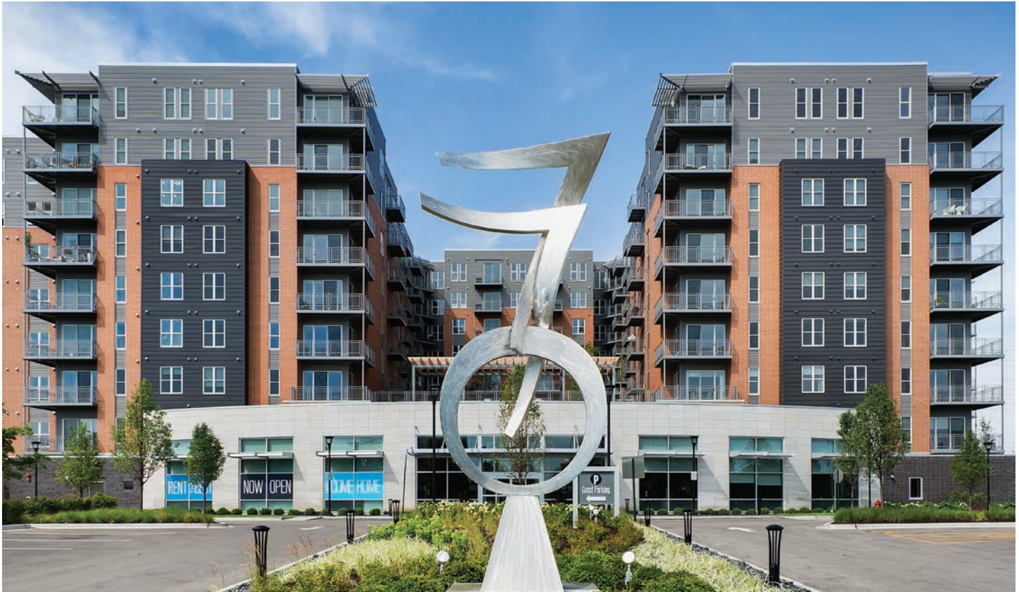
NorthShore 770 and Morningside Construction Managers